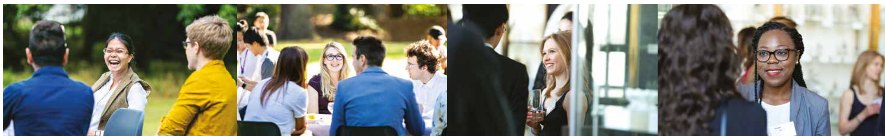
Cambridge Trust students