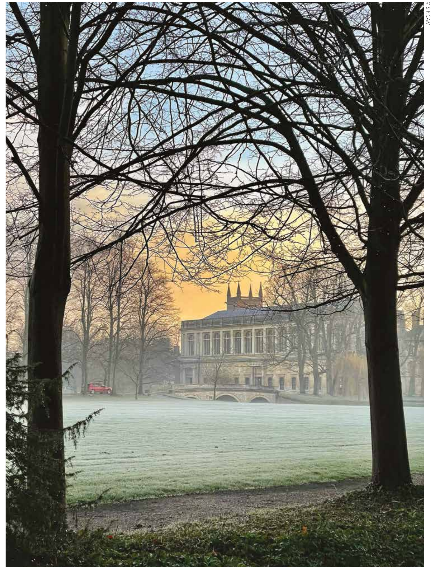
Trinity College, with St. John's College behind