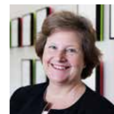
Prof. Dame Ann Dowling, Professor of Engineering Fellow, Sidney Sussex College