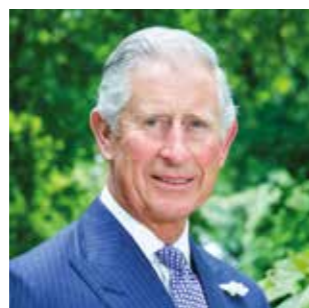
His Royal Highness The Prince of Wales

The Trust is an exempt charity governed by a board of Trustees selected for their skills and experience in order to guide the work of the Trust.